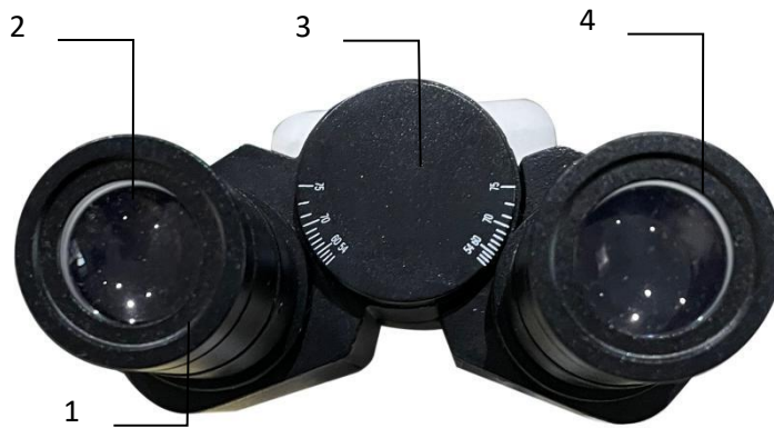
(Abb. 2) Binocular head